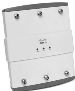
Figure 1. The Cisco Aironet 1250 Series Access Point

The platform was specifically engineered to support the power, throughput, and mechanical requirements of higher-speed WLAN technologies, including 802.11n. Currently, the platform provides both 2.4-GHz and 5-GHz modules compliant with the IEEE 802.11n draft 2.0 standard. As technology evolves, the platform is flexible to support future radio modules designed to deliver intelligent RF services, further enhancing the performance and reliability of the wireless network. The Cisco Aironet 1250 Series is a rugged indoor access point designed for both office and challenging RF environments such as factories, warehouses, hospitals and large retail establishments that require the antenna versatility associated with connectorized antennas, a rugged metal enclosure, and a broad operating temperature range. With a Gigabit Ethernet (10/100/1000) interface, the Cisco Aironet 1250 Series delivers line-rate throughput for higher-speed WLAN technologies such as 802.11n. The access point offers the flexibility of inline as well as local power options.