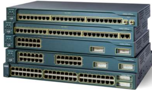
Figure 1. Cisco Catalyst 2950 Series Switches

This complete set of switches offers network managers flexibility when selecting a migration path to Gigabit Ethernet. The two built-in Gigabit Ethernet ports on the Cisco Catalyst 2950G-12, 2950G-24 and 2950G-48 accommodate several GBIC transceivers, including the Cisco GigaStack ® , 1000BASE-SX, 1000BASE-LX/LH, 1000BASE-ZX, 1000BASE-T, and coarse wavelength-division multiplexing (CWDM) GBICs. The dual GBIC-based Gigabit Ethernet implementation provides customers with tremendous deployment flexibility—giving them increased availability with redundant uplinks. In sum, the configuration permits customers to implement one type of stacking and uplink configuration today, while preserving the option to migrate to another configuration in the future. High levels of stack resiliency can also be implemented by deploying dual-redundant Gigabit Ethernet uplinks, a redundant Cisco GigaStack GBIC loopback cable, UplinkFast and CrossStack UplinkFast technologies for high-speed uplink and stack interconnection failover, and Per-VLAN Spanning Tree Plus (PVST+) for uplink load balancing.